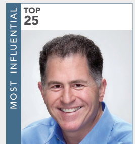
Michael Dell Chairman and CEO

// Our partners are critical to our success and we thank you for the trust you place in us. Dell Technologies will continue to innovate the most comprehensive solutions to help you, and your customers, succeed in the digital future. //