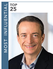
Pat Gelsinger CEO, VMware